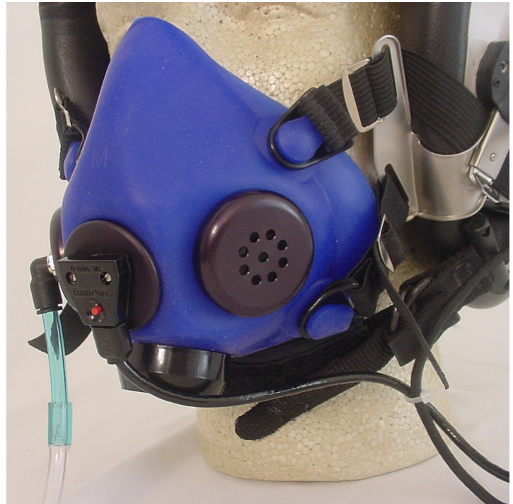
CALL FOR HELMET CONVERSION PRICING

----- Kit Assembly Number Highlighted Below -----